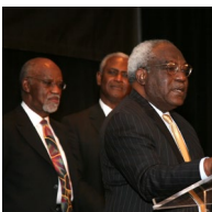
Ferguson, Stein, Chambers, Gresham & Sumter, P.A.

...for championing universal access to economic opportunity and education as essential components of community development.